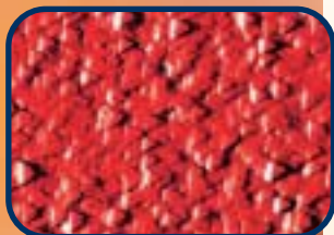
Atomic force microscope image of cuprous chloride thin film.

The School focuses its research activities into four main areas. For additional information and to find out about current available research opportunities, please refer to the specific research group's website or email address.