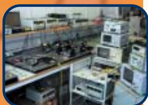
Experimental set-up carried out in the RF and Optics lab.