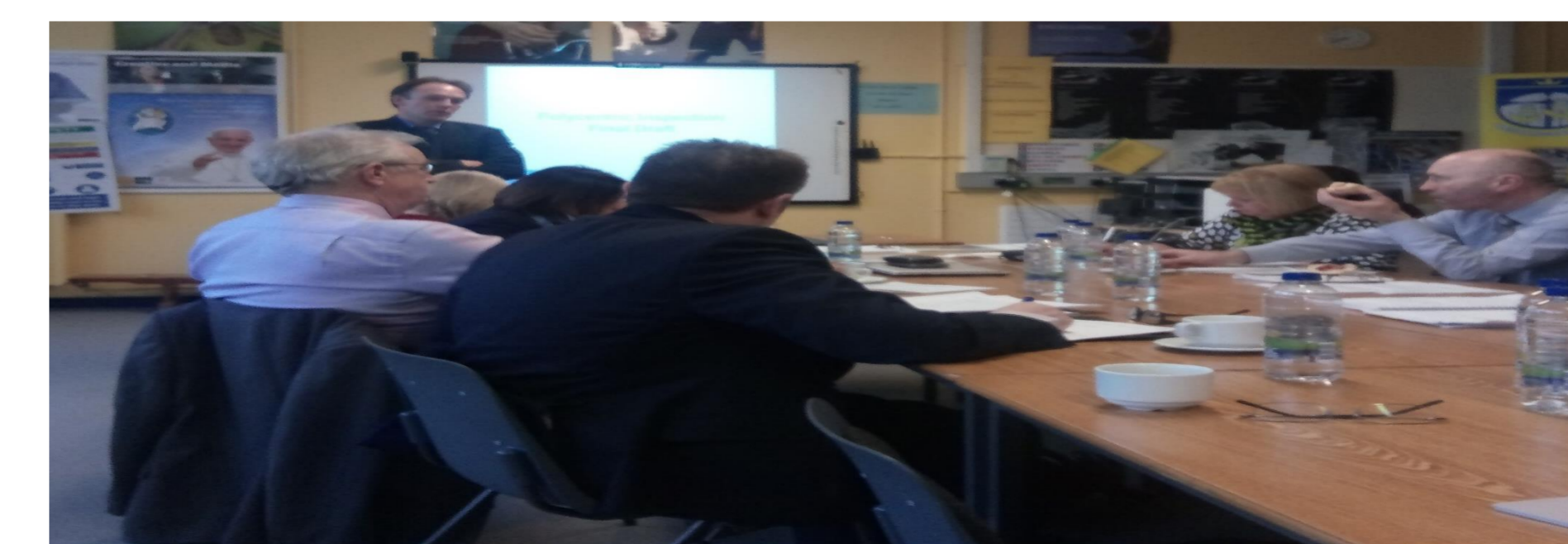
(Impact Evaluation meeting with Northern Ireland inspectorate, and West Belfast Area Learning Community)

We are already seeing the benefits of this Action Research Model in our School (Teacher – North Belfast)