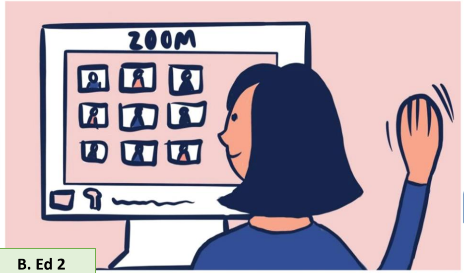
B. Ed 2 Tutor