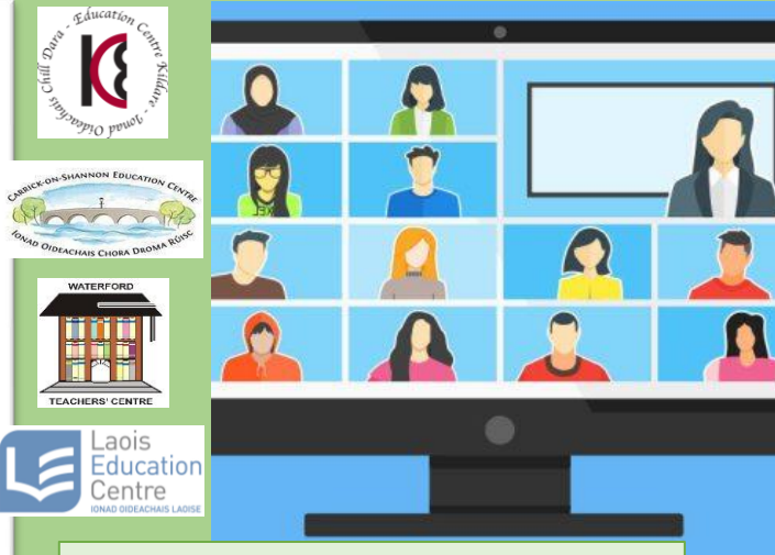
Webinar Facilitator with Education Centres of Ireland