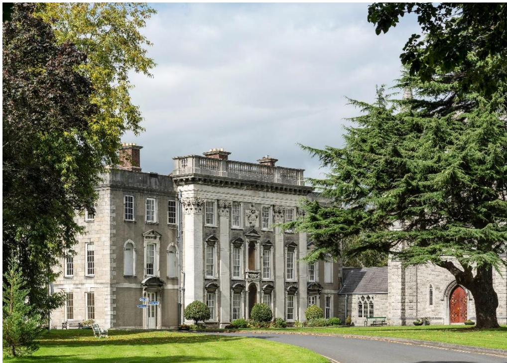
ALL HALLOWS' CAMPUS, DCU. HOME OF THE CHURCH OF IRELAND CENTRE