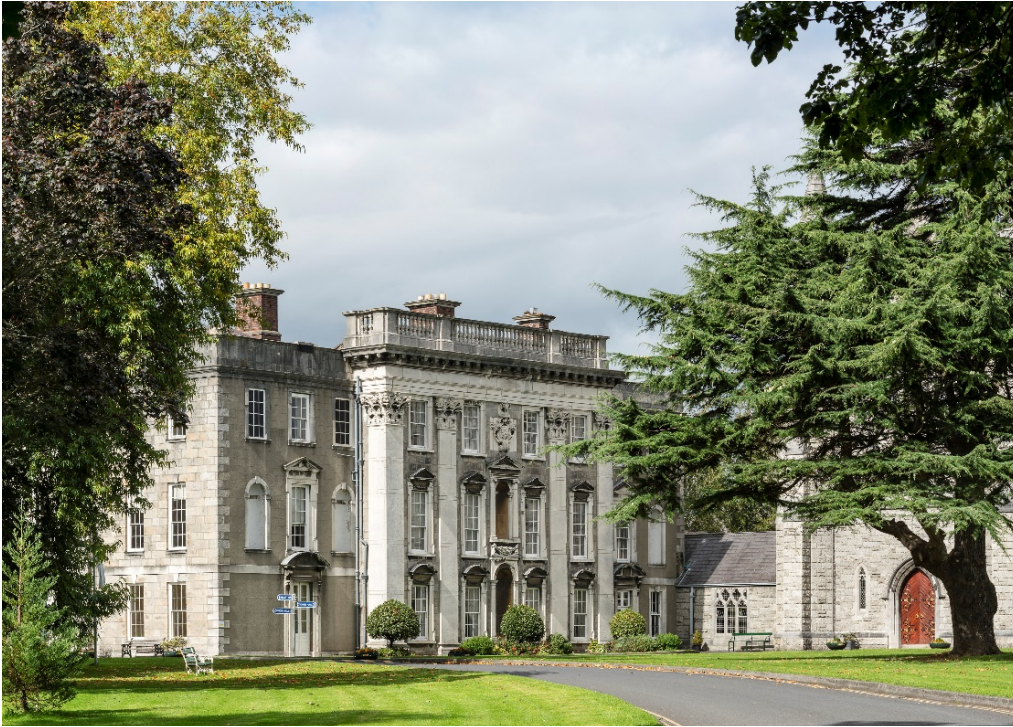
ALL HALLOWS' CAMPUS, DCU. HOME OF THE CHURCH OF IRELAND CENTRE