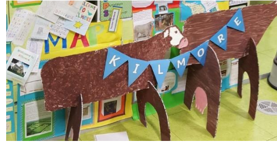
Some local project work from school placement.