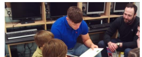
Sharing Bible stories in Drumcondra NS for World Book Day

Most students linked to the Church of Ireland Centre are on placement this term.