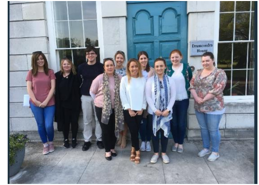
RE Certificate Participants 2018

'I have thoroughly enjoyed attending this course and would highly recommend it to anyone teaching in a Church of Ireland school. My knowledge has increased two fold, I have built up a fantastic bank of resources and I without doubt know my teaching style of the subject has changed for the better'.