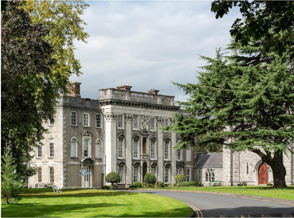
ALL HALLOWS' CAMPUS, DCU. HOME OF THE CHURCH OF IRELAND CENTRE