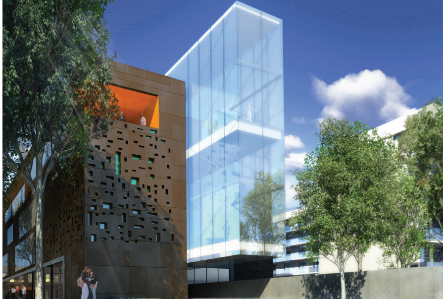
The planned new Institute of Education at DCU