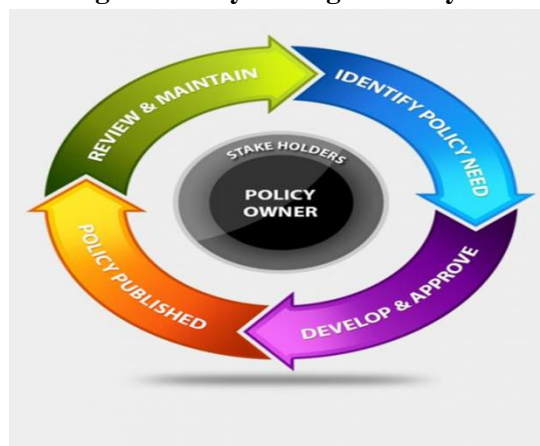
Fig. 1 – Policy Management Cycle

The sequential steps in the Policy Management Cycle above are as follows.