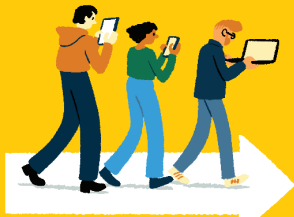
Underrepresented students apply via DCU portal