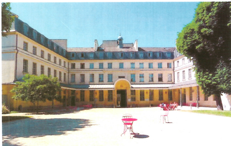
Courtyard of the former Irish College, now the Centre culturel irlandais, 5 rue des irlandais, 75005 Paris

The Liam Swords Bursary is available to Irish graduate students in any discipline who have a specific requirement to spend time in Paris in order to further their studies or knowledge of their chosen field.